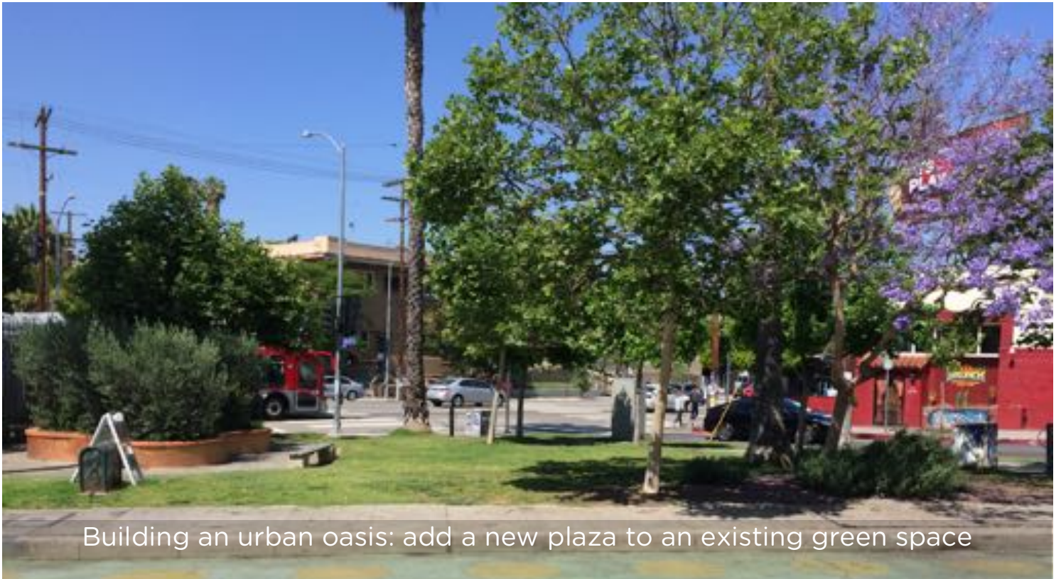
Building an urban oasis: add a new plaza to an existing green space